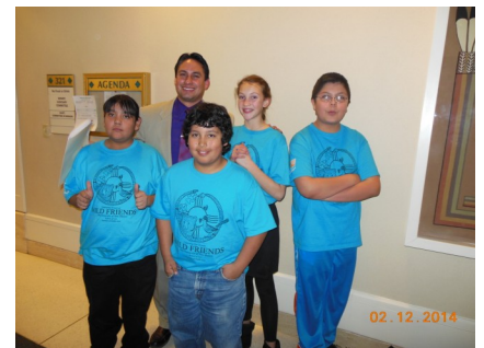
Sen. Morales with students who testified in the Senate Judiciary Committee Hearing on 2/12/14.

ing despite civil and criminal penalties and other efforts at deterrents. Both memorials passed, and the Department says this will help them to fight trophy poaching in the future.