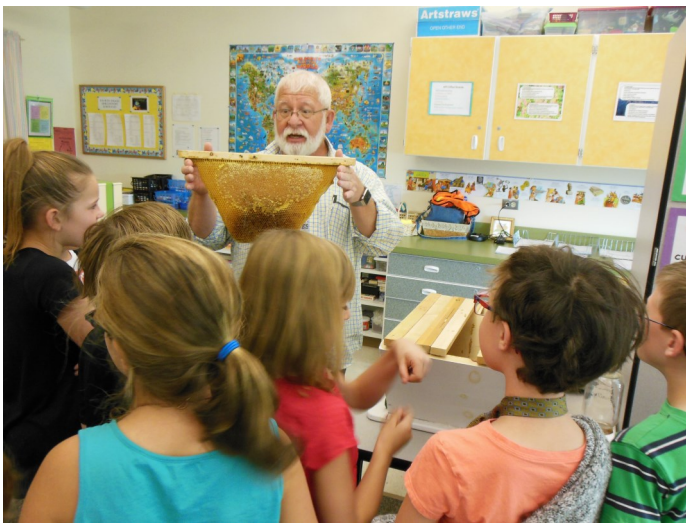
Students receive an outreach visit from a beekeeper

You are joining over 14,000 students across New Mexico who have helped to conserve wildlife through science and legislative advocacy! This fall you will vote on a topic (see ballot on reverse side), do research on your topic, learn about how government works, and then help to draft legislation to address your topic. Starting in January, you will be a part of the 2021 New Mexico Legislative session, advocating for your legislation!