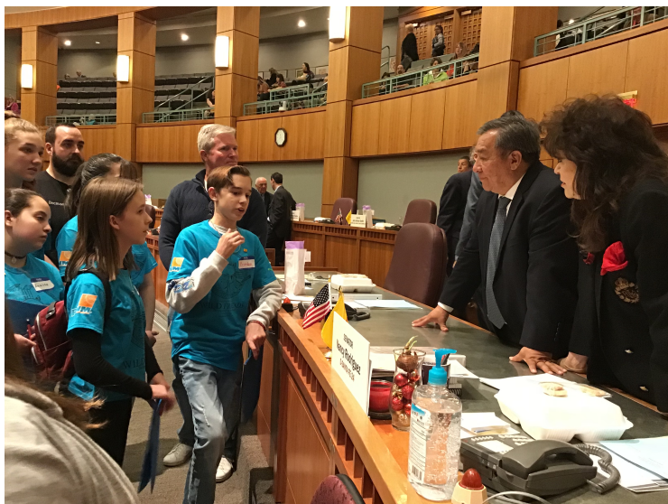
Students talk with a legislator about their bill

You are joining over 14,000 students across New Mexico who have helped to conserve wildlife through science and legislative advocacy! This fall you will vote on a topic (see ballot on reverse side), do research on your topic, learn about how government works, and then help to draft legislation to address your topic. Starting in January, you will be a part of the 2021 New Mexico Legislative session, advocating for your legislation!